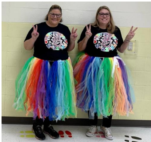
Celebrating 'Twosday' at Grundy

Our boys' basketball team won their regional opener but saw their season ended Friday vs. Champaign Centennial. Still, with 21 victories overall, this year is one to build upon.