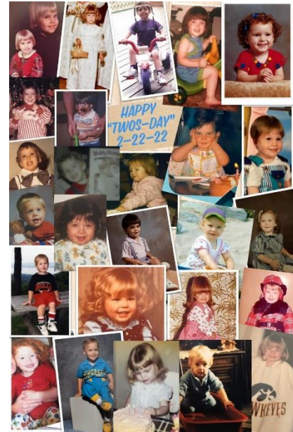
Our teachers were kids once, too!

Our Lady Potters continued their winning basketball ways, defeating archrival Washington for the sectional title and a spot in the Elite 8. They'll play Chicago Heights Marian next week for a chance at another trip to state.