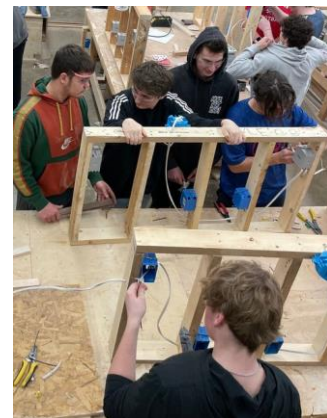
Future homebuilders, MHS

Morton High School will showcase the creative talent walking its hallways with the 10 th annual In Their Own Write performance at 6 p.m. Sunday, March 20 at the Bertha Frank Performing Arts Center. Students will be playing their own instrumental compositions.