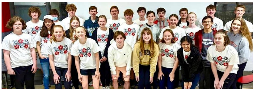
Our Morton High math performers