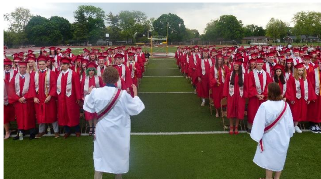
The Morton High School Class of 2022

Again, agreed. As I noted in my own remarks, success requires “sustained effort over time.” The celebrated author and journalist Malcolm Gladwell has written that mastery of any task requires 10,000 hours of deliberate practice. So patience – like the patience we displayed in waiting out the raindrops Saturday, like the patience we exhibited all through the trials of the last two years – is