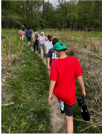
Jefferson field trip to Forest Park

required. But when we do that, as our Class of 2022 and their families did over the last four years, we can get the most positive, life-changing results.