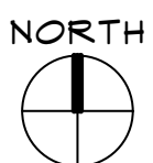
SITE PLAN - OPTION K SCALE: 1" = 50'-0"