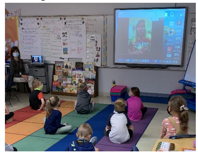
Attentive first graders at Lettie Brown

Please note that 243 students are now in remote learning, down from 257 two weeks ago as families continue to trickle back to our buildings. We welcome