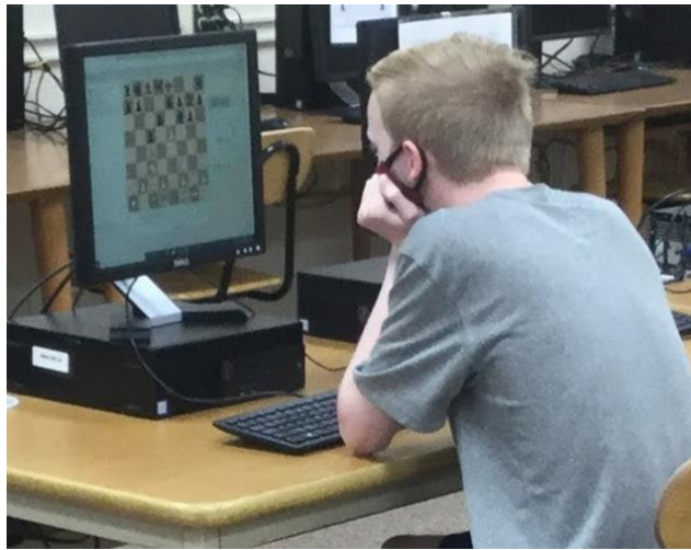
Checkmate with MHS Chess Team

New analysis provided by the Tazewell County Health Department , meanwhile, is encouraging, insofar as our schools are concerned. If Morton as a community has