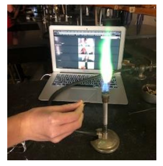
MJHS chemistry experiment beamed home

In addition, we are asking all parents, students and staff members to pay very