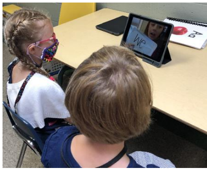
Reading lesson, Lincoln first-graders

We continue to correspond daily with the Tazewell County Health Department regarding any COVID cases, close contacts and protocols. Please continue to utilize our COVID form .