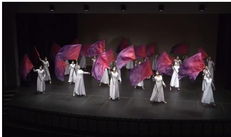
Morton High Color Guard performs

On the athletics front , Illinois High School Association (IHSA) and Illinois Elementary School Association (IESA) officials have at long last met with representatives of the Illinois Department of Public Health and the Governor’s Office.