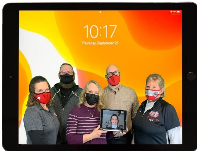
Behind-the-scenes IT crew has made our efforts a big success

As reported last week, we are moving forward on getting teachers and other staff vaccinated. The Tazewell County Health Department tells us that the Tri-County region is moving to the 1B vaccination level, which includes educators, on Monday, Jan. 18.