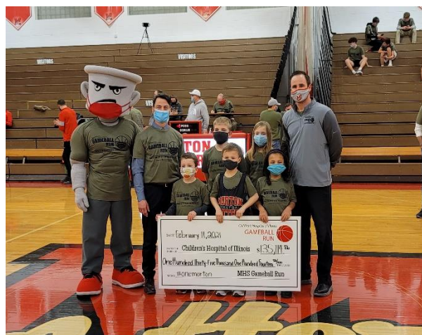
Our Miracle Children pose at the check presentation