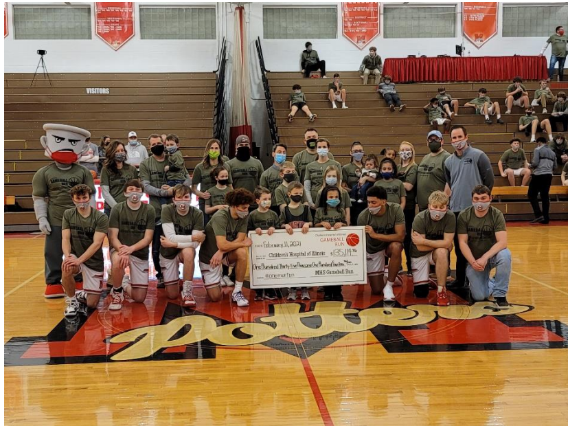
Morton teams stand up for Children's Hospital, once more

As always, the Run included the MHS boys' basketball teams, employees of Morton District 709, and students contributing $25 or more to the cause. Often, Gameball Run is a family affair, with parents participating alongside their children. Beyond that, the event would be impossible to pull off so successfully without the support of the community at large. In 2021, 45 sponsors contributed between $250 and $3,500 each.