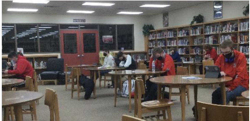
Morton High chess team competes in the state finals online

Department regarding any COVID cases, close contacts and protocols. Please utilize our COVID form . Our Healthy Quarantining Guide and our Return to School Plan should remain go-to resources, as well.