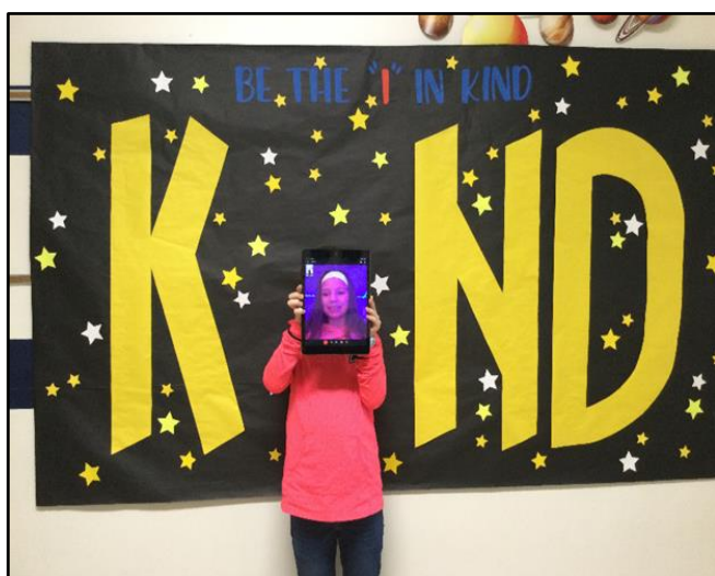
No one misses out on Kindness Week at Lettie Brown

Health and attendance numbers were almost a mirror image of the week before in Morton public schools as we approach our 130 th day of in-person instruction.