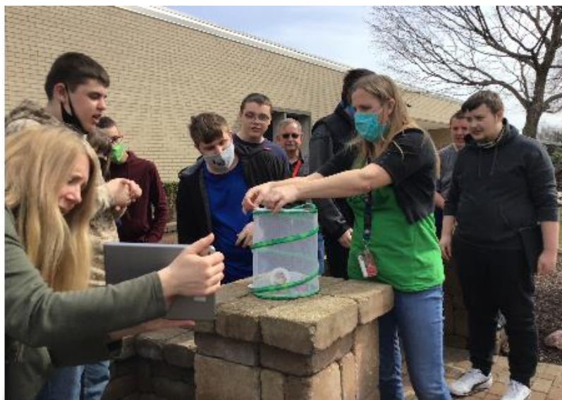
Freeing the caterpillars-turned-butterflies at MHS

Perhaps that was to be expected, given the recent warm weather, holiday get-togethers and vacations. All in all, however, we can't complain, as we remain near school-year lows where COVID is concerned. Still, we're now in the final stretch of this 2020-21 school year and we want to see it all the way through the finish line as successfully as we've run the race, to date.