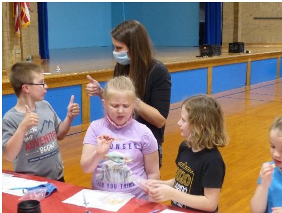
Thumbs up to diversity awareness at Jefferson!

Our soon-to-be graduates concluded a successful Senior Send-Off Friday. We will be sorry to see them go, they were asked to rise to the challenge like few classes before them, but in many ways we – and they – are the stronger for it.