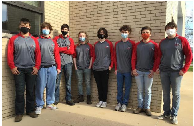
Our overachieving Morton High Spark Monkeys