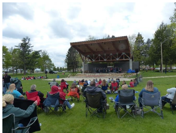
Arts in the Park

Hundreds of parents and community members attended our Arts in the Park event this past week, and they were treated to some really wonderful performances by our students. Jefferson Elementary School hosted its Bike and Walk to School Day , following up on its Disability and Diversity Awareness Fair of