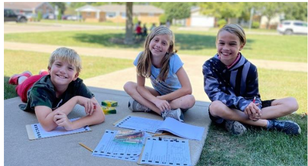
The classroom heads outside at Grundy

As a district, we continue to push state government to allow more decision-making at the local level. To that end, we had an audience with the State Board of Education this past week in Springfield, along with many other superintendents who were there to share the same concerns. We are one of 146 districts that have joined the Make It Local Initiative.