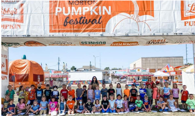
Jefferson students getting into the Morton Pumpkin Festival spirit

Meanwhile, we are moving forward with testing for staff who have not been vaccinated. Ultimately, we will be using SHIELD, a saliva test that is less invasive and more accurate than other alternatives. To begin, however, we will be using a nasal test while SHIELD is being set up. Testing is funded by the federal government, at no cost to Morton District 709. Even so, the mandate has taken a substantial amount of planning and time in a very short period.