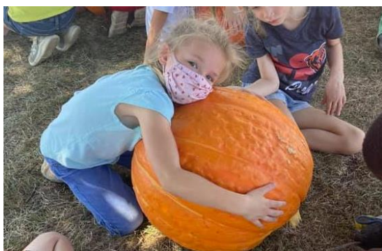
This is my Great Pumpkin, Charlie Brown

High school homecoming week is just 10 days out, and many of our other rites of passage are happening or are in the planning stages, in keeping with our unwavering commitment to normalcy.