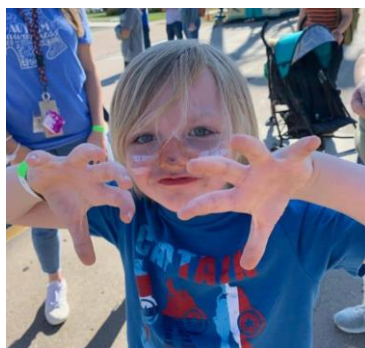
Welcome to Lincoln

The School Board is set to approve the district's 2022-23 budget and tentative levy at its meeting on Tuesday. The application process is now closed for the vacant School Board seat, with the board intending to act on its choice in the near future.