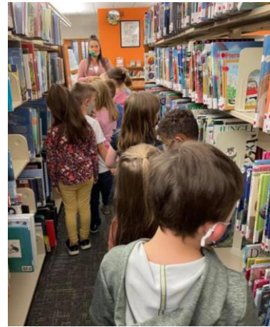
Combing the library aisles at Jeff

Coming off a very successful Homecoming week, we're settling back into our routines here in Morton District 709.