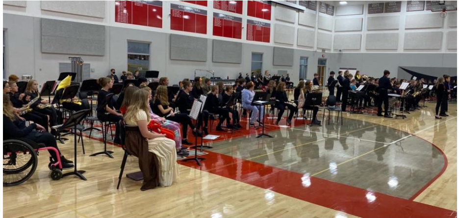
Fall concert plays to a near-full house at Morton Junior High School