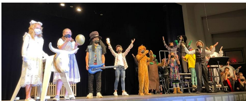
The cast of 'Oz' performs at Lincoln Elementary

Our boys' soccer team won a regional title Friday, our football team capped a fantastic year – with more to come – as Mid-Illini Conference co-champs, and our number-one-ranked boys' cross-country team begins its march on Saturday to the state finals at Peoria's Detweiller Park.