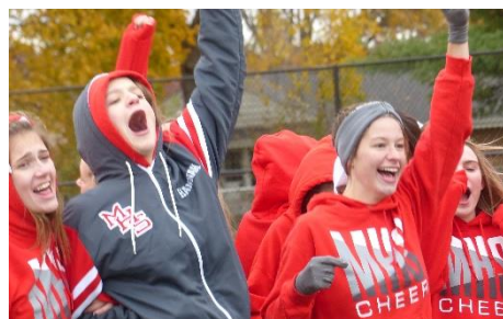
Cheering on the home team

Please help us line the route between Morton High School and Interstate 74 as we give our gridiron heroes a raucous send-off at 11 a.m. Saturday. A victory sends us to the Class 5A championship game. What a wild and fun ride this has been!