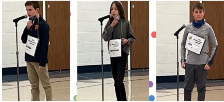
Highlights from the Lettie Brown Elementary Spelling Bee

We continue to abide by the Governor's executive orders and the State Board's mandates because we do not want our students and families to bear the brunt of any potential discipline should we not. This litigation does not invite such action from the state.