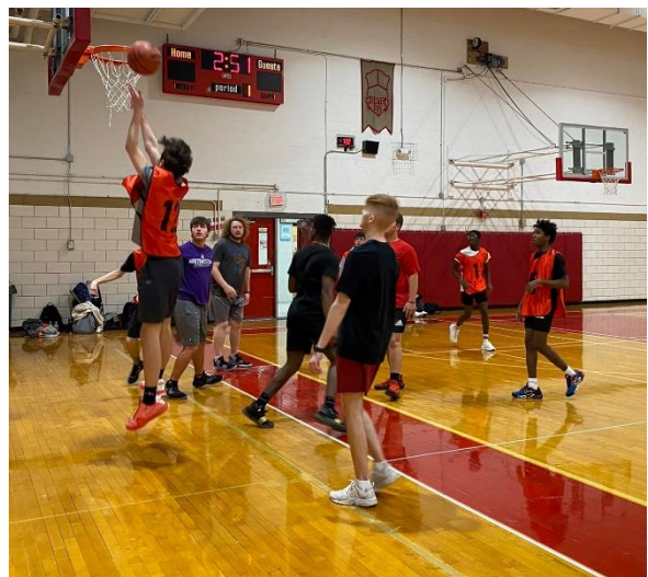
MHS Intramural Basketball League

scheduled on Thursday and Friday, Feb. 10-11. Gameball Run T-shirts are available for purchase now, so let's resolve to color our campuses and community with tie-dye, for a fantastic cause.