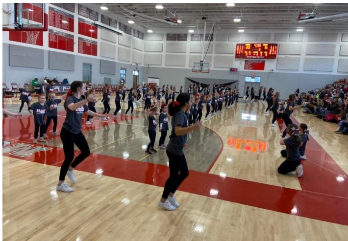
The Girls' Night Out clinic at The Kiln at Morton Junior High

It is about COVID – specifically the state's threats to withdraw a district's certification status and withhold funds for non-compliance with its mitigation orders -- but it goes beyond that single issue to the overall principle of local control.