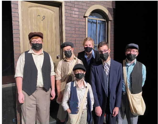
Morton students participate in Penguin Project production

The big news this past week was the Morton School Board's decision to initiate litigation against the Illinois State Board of Education and the state Superintendent of Schools. We are being joined in that effort by the Eureka and Clinton public school districts, with the lawsuit also under consideration by others.