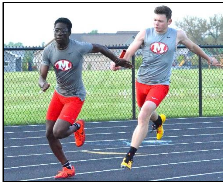
Teamwork on the track

Our Staff Awards Ceremony will occur this coming week, May 25.