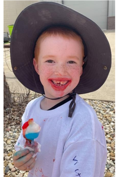
At Grundy, one happy DQ customer