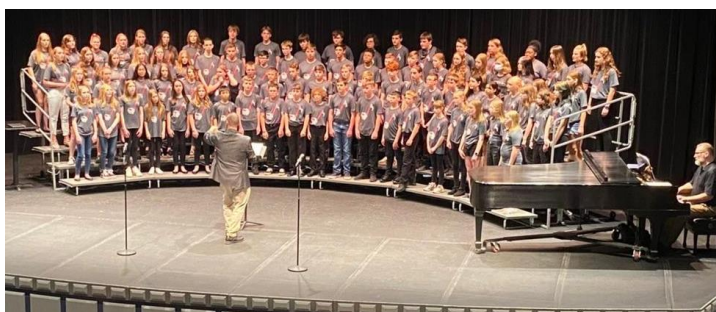
Last choir concert at Morton Junior High

Again, please monitor student symptoms at home and err on the side of caution, as we wish to finish this very successful year on a high note, with fingers crossed that our weekly health chart will