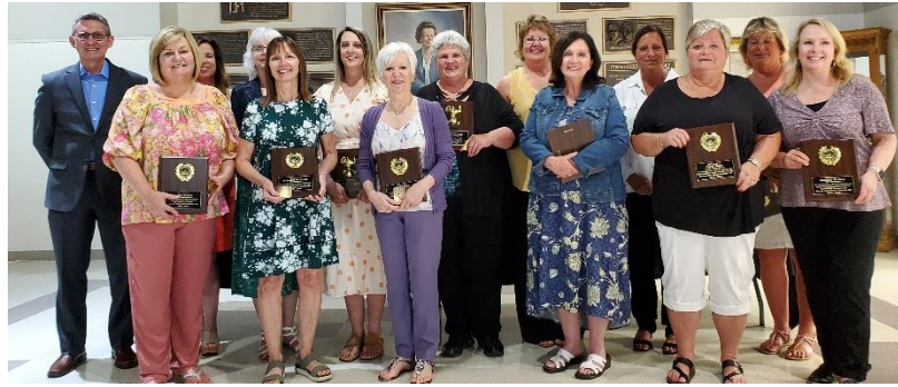
Graduating Employee Class of 2022

futures are built upon the shoulders of those who came before. To all, thank you for your contributions, nothing but the best, and you're always welcome back. Once a Potter, always a Potter.